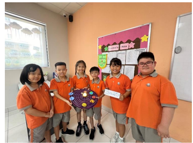
Handmade Club - Gifts for mothers on Women's Day (08/03)

Handmade Club, with the theme of Happy International Women's Day on March 8, allowed students to make creative and cute headbands to give to their mothers. The students came up with amusing and exciting decoration ideas for the classroom that were extremely interesting. They can get creative by decorating easy-to-make handicrafts with familiar images. Images of hearts and flowers contain love.