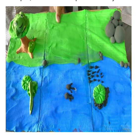
Group 1, 2: Mode of amphibian life cycle

Using simple materials such as paper, clay, lego, etc., students created accurate, scientific, and creative models. Through this project, students can practice teamwork skills, presentation skills and criticism skills.