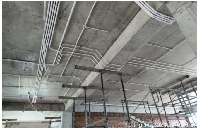
MEP pipelines installation (1F)