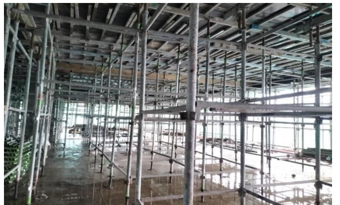
The second and third-floor areas