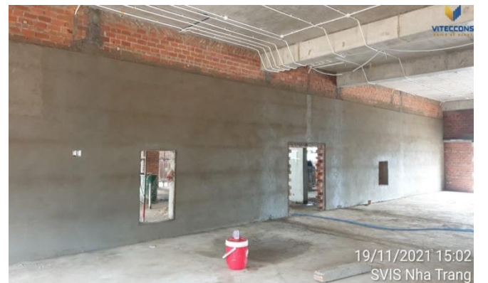
Construction of the first floor walls