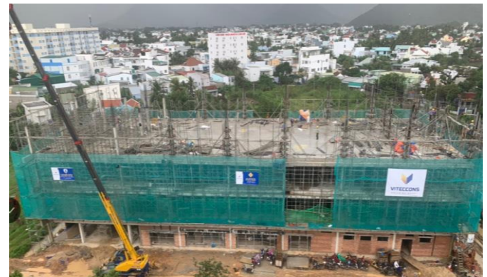
Block 2 frontage