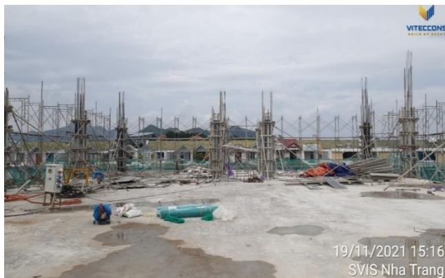
Concrete for the 4 th floor